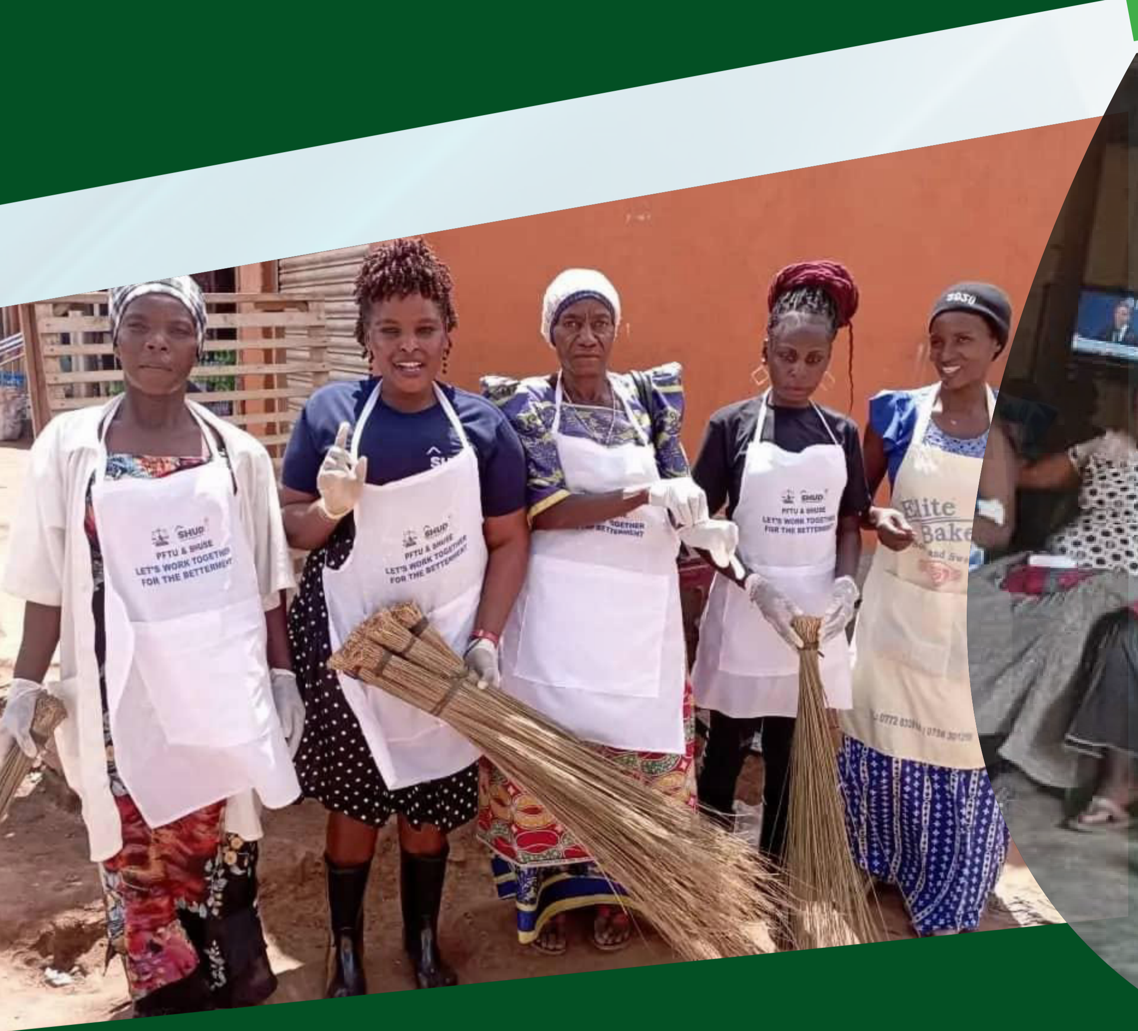
Community CleanUp Drive