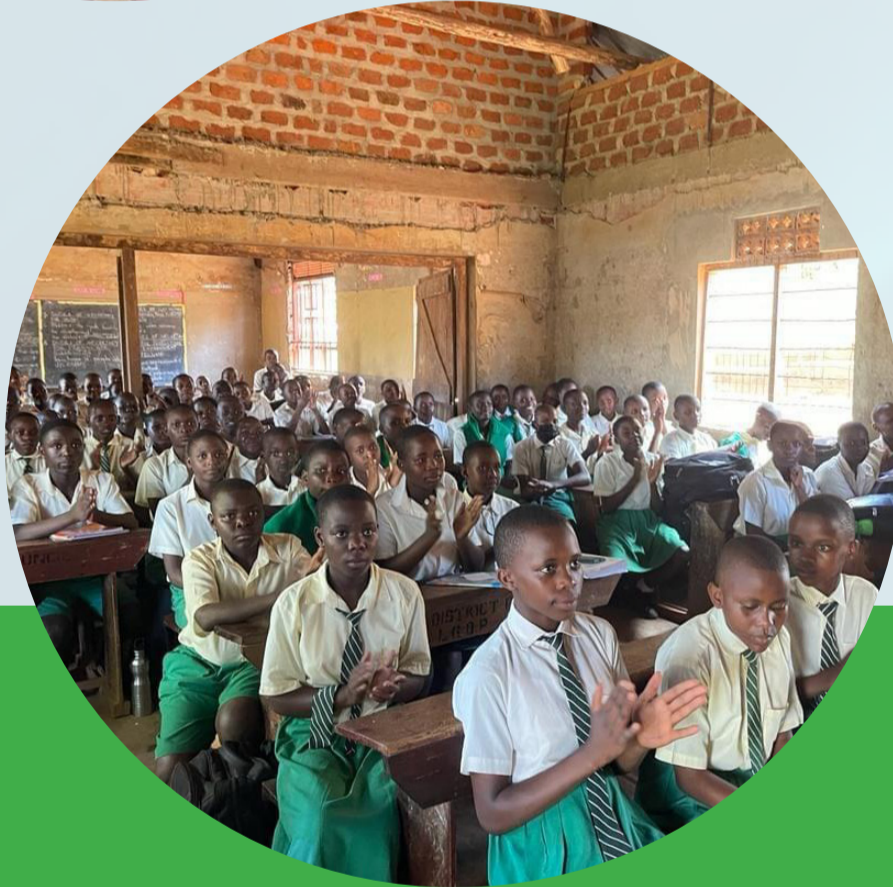
Empowering School going children through debates